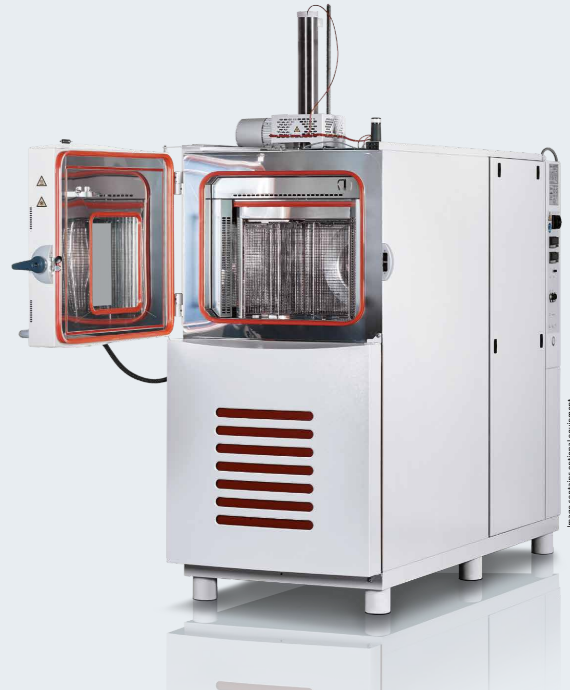
Image contains optional equipment

No need to worry about loss or excess of temperature: Test-chamber and test-object protection and test object shutdown are installed as standard. The test chamber itself is designed for operation at ambient temperatures of up to +35 °C, complying with the current VDE regulations and satisfying the EMV, low voltage and machine directives.