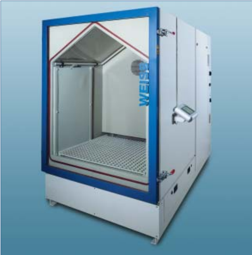
Corrosion Climate Alternating Test Chambers Type SC 1000/20-70 IU with freezing to -20^{\circ}\text{C}

A complete product range for temperature and climate testing is available, with test space volumes of approx. 34 litres to 2,160 litres and working ranges of -75 \dots +180^{\circ}\text{C} and 10 ... 98% r.h.