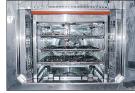
Test space with specimens