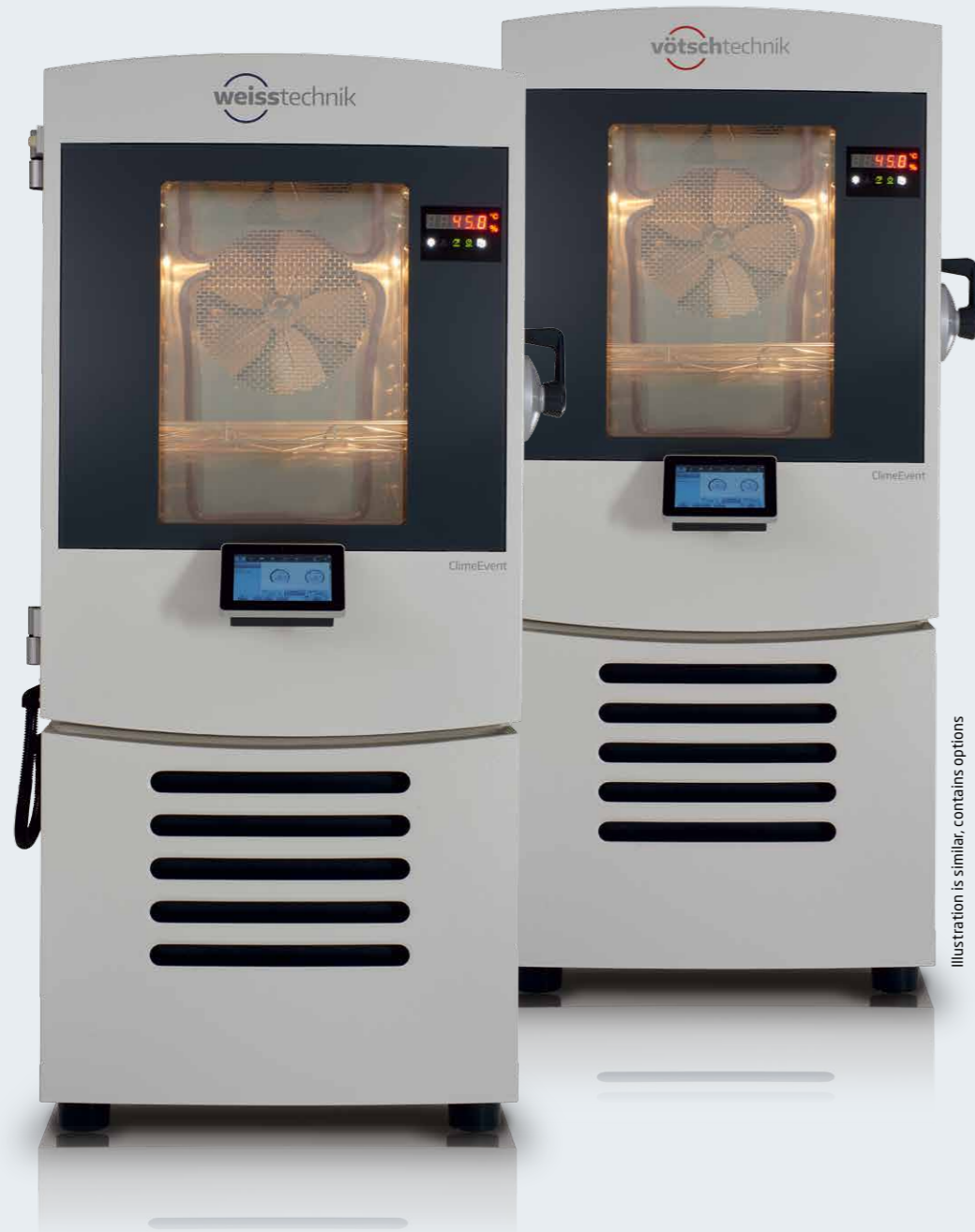
Illustration is similar, contains options

You can find further details on equipment in our technical descriptions. Contact us.