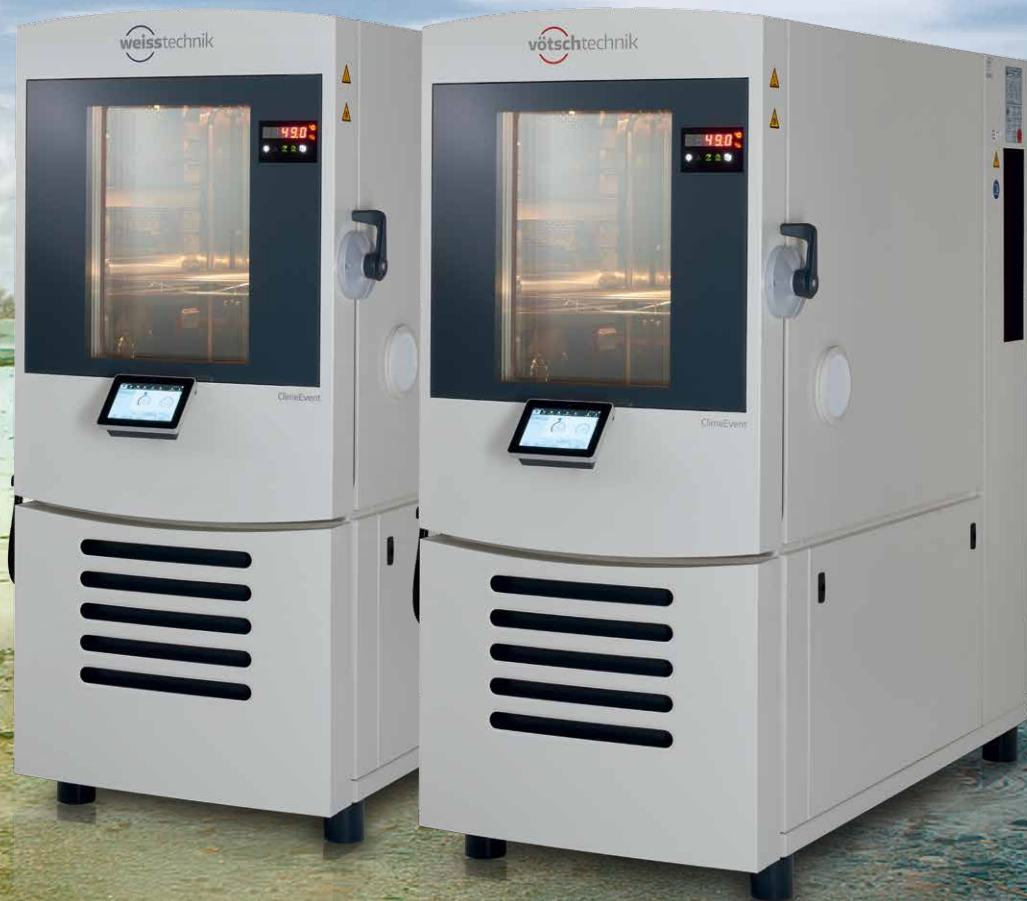
Illustration is similar, contains options