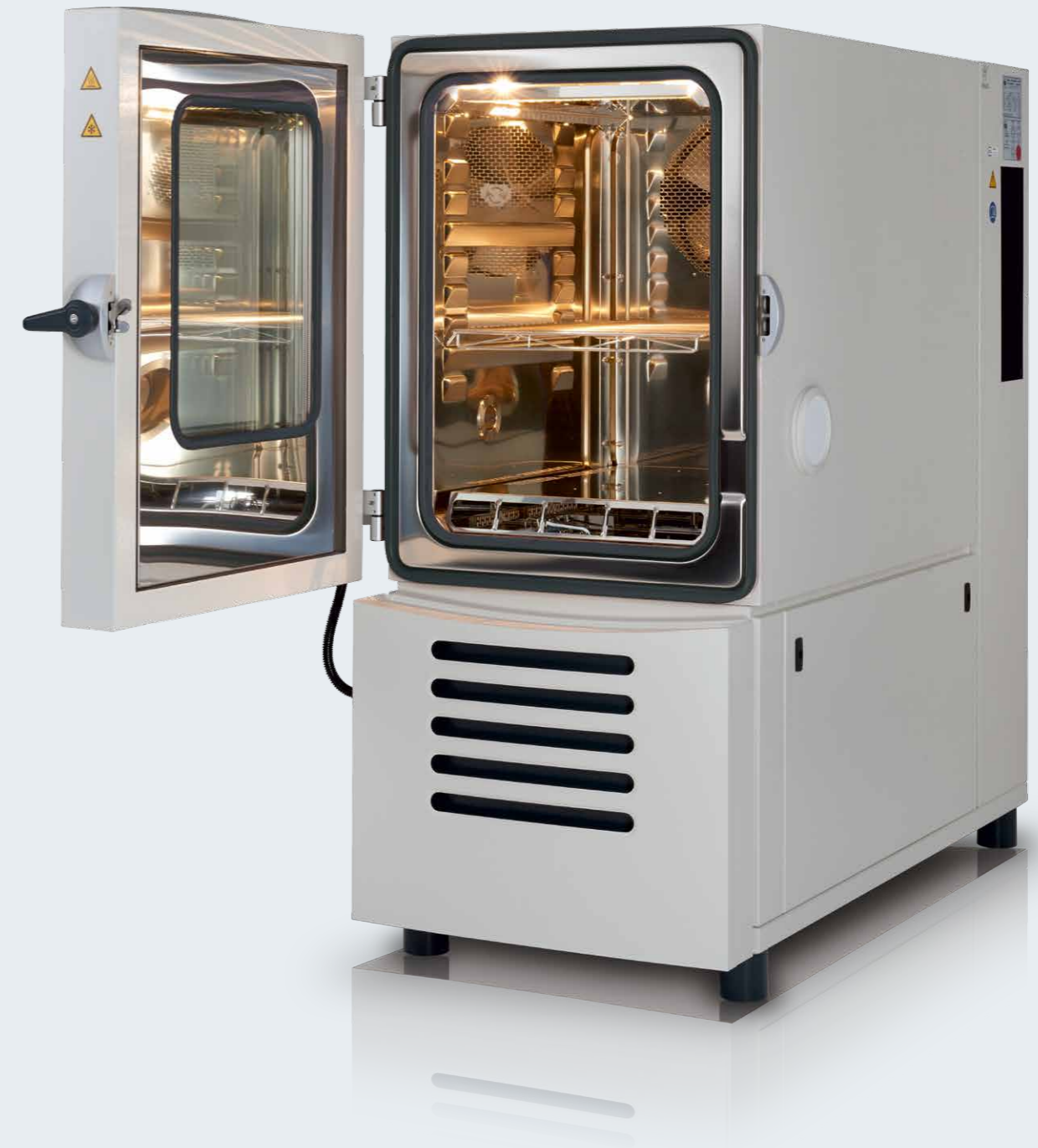
Illustration is similar, contains options

You can find further details on equipment in our technical descriptions. Contact us.