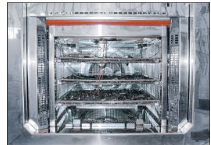
Test space with specimens